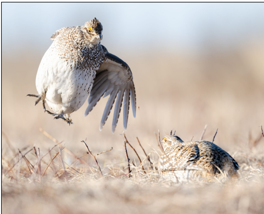
taken at Crex Meadows in Spring 2025