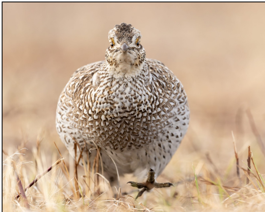
taken at Crex Meadows in Spring 2025

We hope you enjoy this issue of the newsletter. As always, there is a lot going on with STG in Wisconsin and WSGS trying to stay involved where we can. Have a safe and enjoyable fall season! If you happen to be in the NW Sands area doing something STG related, consider stopping at some of the local establishments for supplies and refreshments if you are able. Let those merchants know you are in the area enjoying the birds. It might just help someone see the STG as a more valuable component and give them incentive to support.■