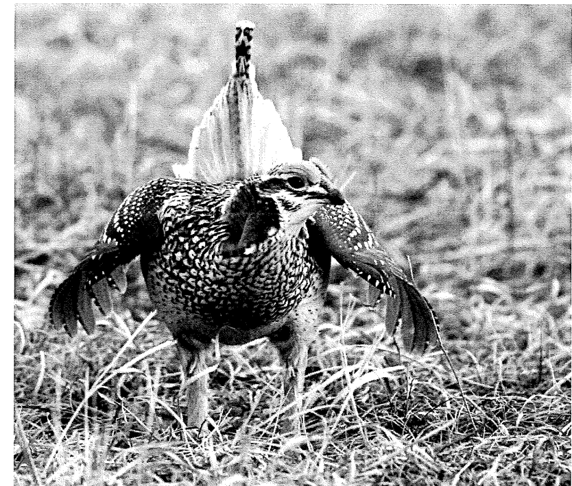
Sharp-tailed Grouse at Crex Meadows WA