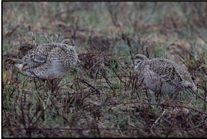
Sharptails at Crex Meadows, Spring 2023

https://issuu.com/wisconsinnaturalresources/docs/final-final_spreads_summer_2023/s/26334760